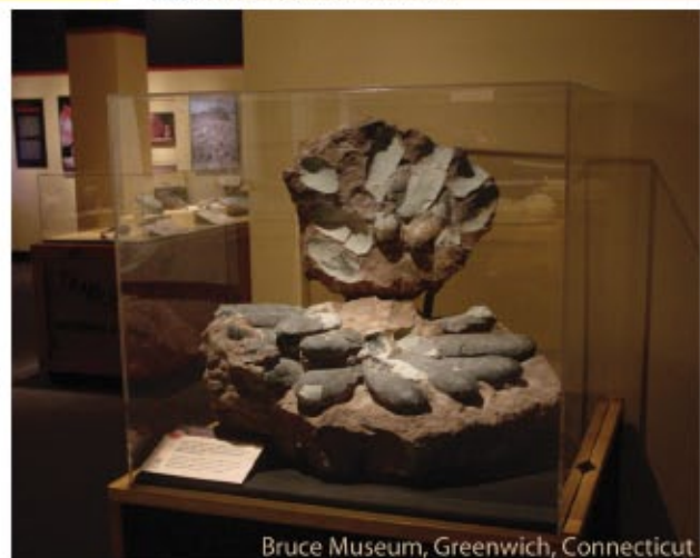
Bruce Museum, Greenwich, Connecticut