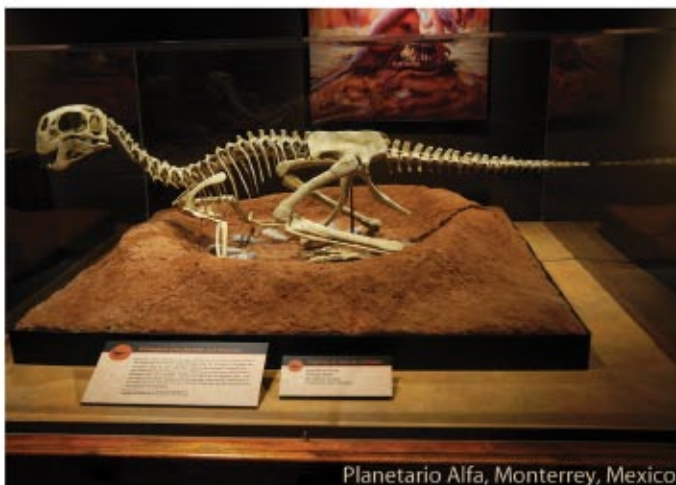
Planetario Alfa, Monterrey, Mexico