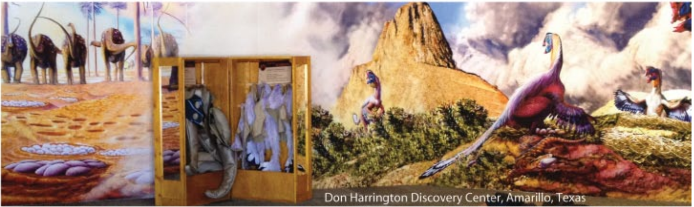
Don Harrington Discovery Center, Amarillo, Texas